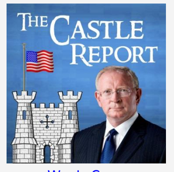
War In Gaza